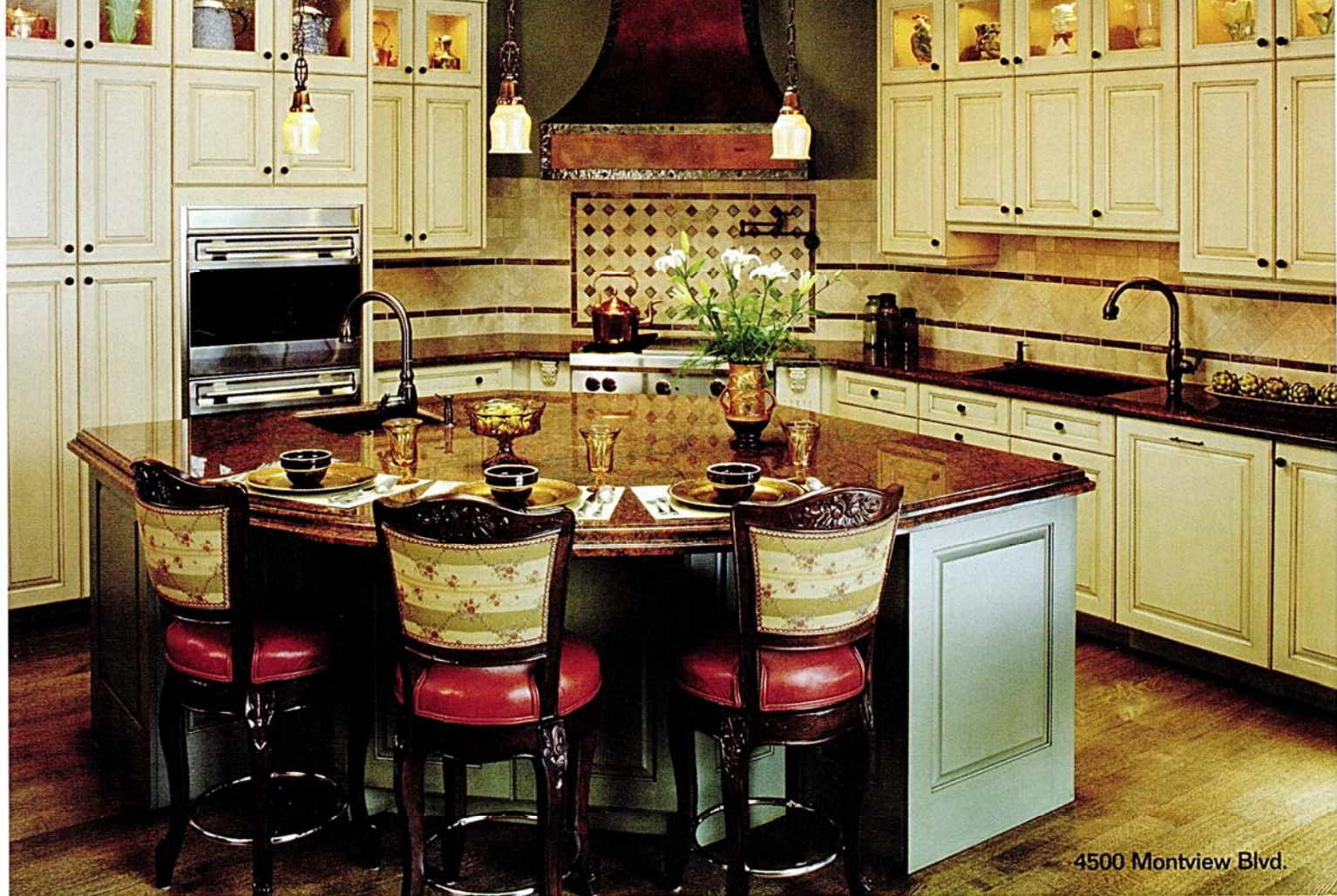
4500 Montview Blvd.

Above: Living Design Studios led this kitchen addition with a French Country flair at 4500 Montview Blvd. Right: At 5639 Montview Blvd., Thurston Kitchen & Bath created this serpentine-shaped cooking island with a Viking range.