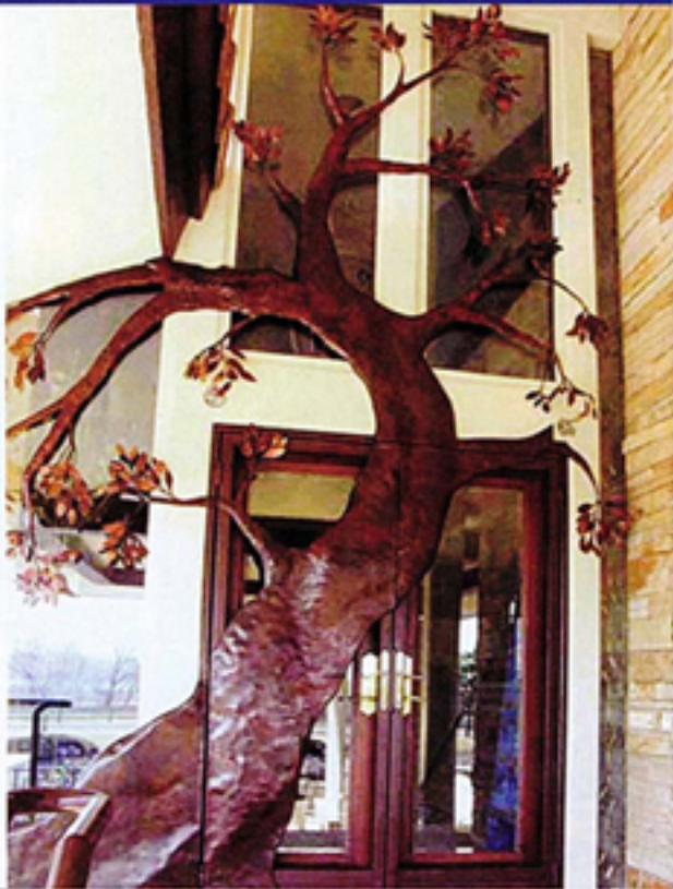
Metalwork ranges from sculptures and decorative designs to handsome functional products.