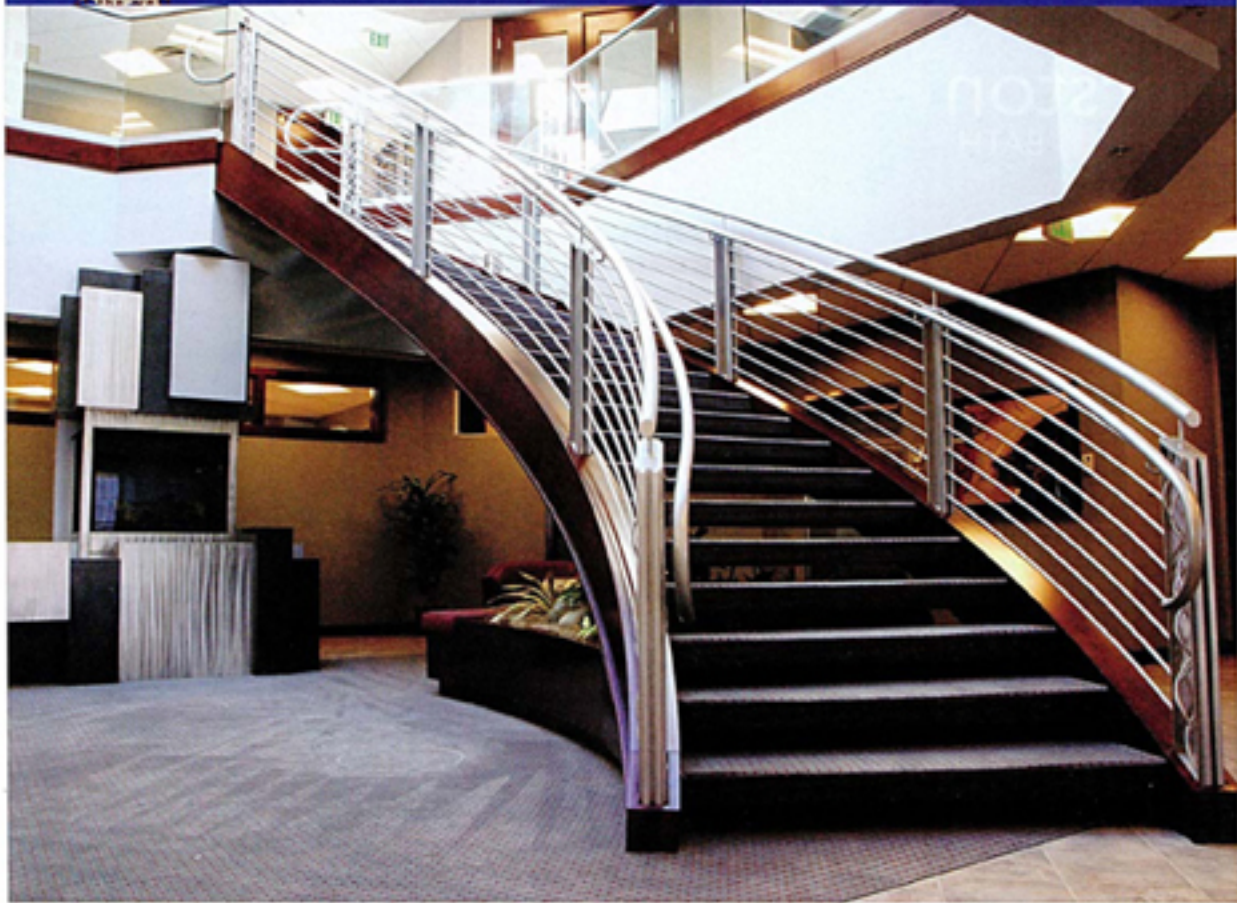
Hand railings are fabricated by skilled metal workers with meticulous attention to detail.